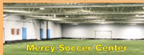
Mercy Soccer Center

Convenient Bus Transportation Available!