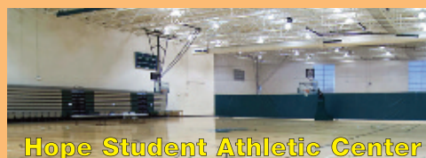
Hope Student Athletic Center

Hi-Five has exclusive use of these state-of-the-art indoor facilities during inclement weather for soccer, football, baseball, basketball and more!